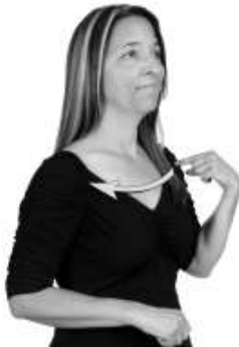
Figure 3. The ASL sign WE.

British Sign Language (BSL). She also observed some subtle differences between ASL and BSL, such that certain so-called “exclusive” forms pointed better in BSL. In general, number marking may lead plurals to point less well than singulars in signed languages. However, as Cormier et al. have also observed, signed languages vary in whether or not they have first-person plurals akin to ASL WE.